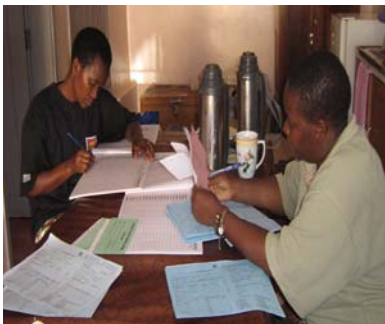
Nurse counselors doing data entry in the Pre and ART registers for proper patients' follow up and data management