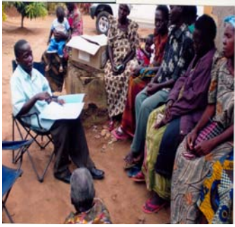
Clinician giving adherence counseling talk to clients prepared for ART initiation