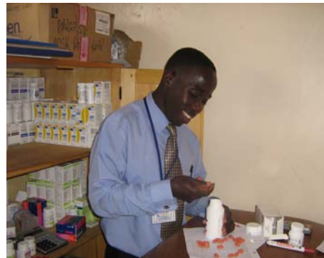
Pill count being done for the patients' refills to allow proper monitoring of adherence and drug requisitions