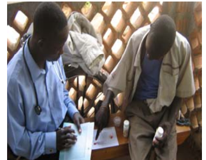
A Client demonstrating his understanding of how to take his Medicine given after initiation on ARVs.