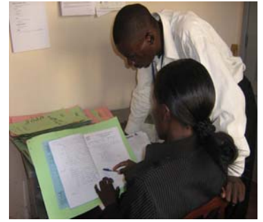
HIV Medic & the ART Aid monitoring patients' adherence through file review