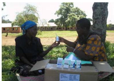
A Nurse giving treatment education and ART adherence counseling to client who had come for refills