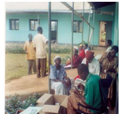
Expert clients and HIV Medics helping to dispense & pill count drugs at Mbirizi center.